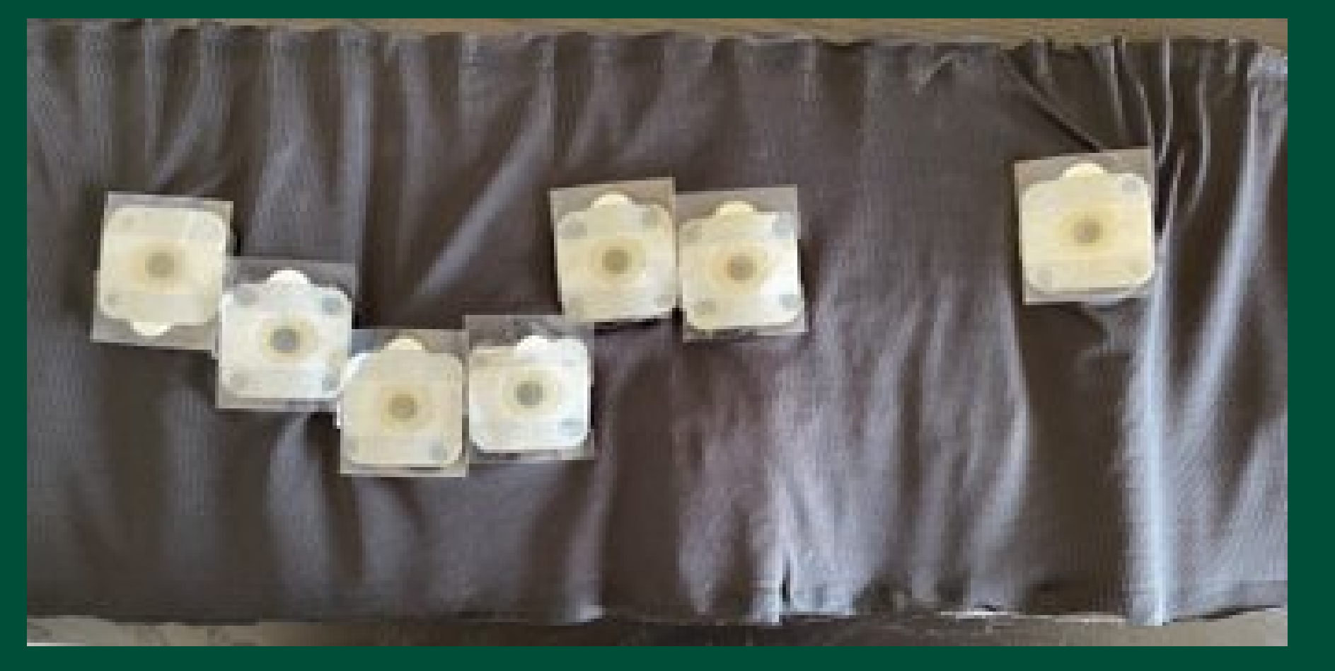
Figure 5: TORSO COMPRESSION STRAP INTERIOR SHOWING 7 ELECTRODE CONFIGURATION.

Currently the device is 83% completed due to time constraints. Further development will be approached later to bring functionality to the Bluetooth connectivity and Baseline Wander Elimination program.