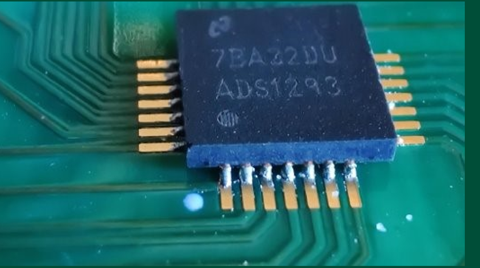
Figure 6: ADS1293 Electrocardiogram Instrumentation Device.